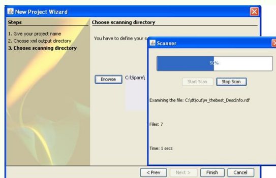
Scanning and extracting metadata from the file system