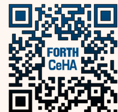
CeHA web site

The ICS suite follows high quality international trends regarding both the structure of the Electronic Health Record (EHR), as well as integration with third party systems through the use of internationally acclaimed standards and protocols (like HL7, DICOM, etc.). Different components of the health information infrastructure are deployed in several integrated regional health information systems in Greece since 1998.