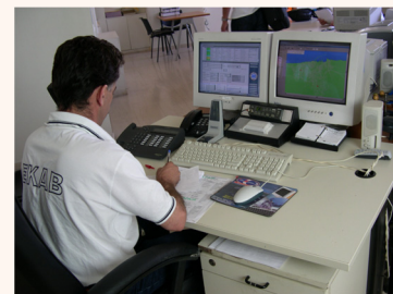
Health Emergency Coordination Center Management Application in use