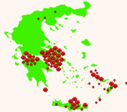
ICS Installations in Greece since 2005

The Health Emergency Coordination Center Management is a robust and reliable application that delivers state-of-the-art performance using 64-bit architecture and web technologies. It is compatible with major database management systems and with the latest versions of all popular web browsers.