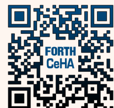
CeHA web site

Other products of the pre-hospital emergency care family (ICS-E) of ICS include applications for the Telephone Operator (PHE-TO), the Radio Dispatcher (PHE-RD), Incident Monitoring (Coordination Center part) (PHE-IM), Incident Monitoring (Ambulance part) (PHE-AA), Automated External Defibrillator Network Management (PHE-ED), and Pre-Hospital Emergency Care Protocol Management (PHE-PM).