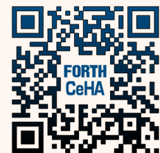
CeHA web site

Other products of the patient administration family (ICS-A) of ICS include applications for the Outpatient Clinic Admissions Office (A-OAO), the Emergency Department Admissions Office (A-EAO), the Outpatient Pharmacy Admissions Office (A-PAO), the Radiology Information System (A-RIS), the Information Office (A-INF), the Patient Accounting Office (A-PAC), the Appointment Booking System (A-ABS), the Emergency Department Patient Book (A-EDPB) and the Hospital IT Department (A-ITD).