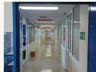
Patient Hospitalization Support