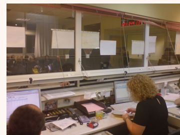
Emergency Department Admissions Office Application in Use