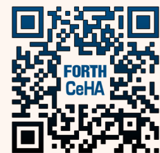
CeHA web site

Other products of the patient administration family (ICS-A) of ICS include applications for the Outpatient Clinic Admissions Office (A-OAO), the Outpatient Pharmacy Admissions Office (A-PAO), the Radiology Information System (A-RIS), the Inpatient Admissions Office (A-IAO), the Information Office (A-INF), the Patient Accounting Office (A-PAC), the Appointment Booking System (A-ABS), the Emergency Department Patient Book (A-EDPB) and the Hospital IT Department (A-ITD).