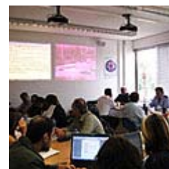
Control and coordination centre

Crete is liable to be affected by earthquakes, which is why it was chosen for the demonstration of a system that can not only be used for emergency response coordination but also for understanding the health situation and monitoring for epidemics that are the frequent consequences of natural disasters.