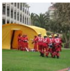
Casualty treatment station

In several sites on Crete, such as a power plant, a beach, and a hotel, the response of the rescue teams was tested as they were communicating via a satellite network. A dialogue was set up with voice and video between the teams on site and a centre for control and coordination in downtown Heraklion, which allowed a quick assessment of the means needed to set up and facilitate the process of intervention.