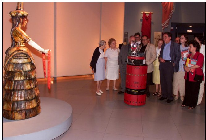
Figure 2: Visitors tour the FHW costume exhibition with the help of the robot during TOURBOT's first trial and event in May 2001.

A large number of on-site visitors of all ages interacted with the robot while following it around on the tours. Lefkos served on-site visitors in 39 different sessions. During these sessions, Lefkos, often had to conduct a tour among crowds of people, who blocked its sensors, while the random position of the visitors affected the robot's perception of the workspace, blocking passageways and drawing the robot to un-prescribed areas. Lefkos quickly detected such situations and made its way towards the exhibits, providing safe and reliable navigation, through crowds of people, for many hours. Of particular significance is the fact that the robot, when unhindered, moved at approximately walking speed.