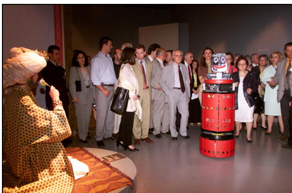
Figure 4: The TOURBOT robot leading the tour through FHW's "4000 years of Hellenic Costume" exhibition.

In summary, the advancements proposed through the TOURBOT project's approach include technological and conceptual novelties. TOURBOT capitalizes on relevant technologies to contribute to developments in remote access to cultural heritage. Moreover, it introduces a new model of remote information browsing over the Web. A few years ago, Web browsers were quite primitive; now they are becoming increasingly sophisticated and there are already versions of browsers that allow manipulation of three-dimensional worlds. The next step in this evolution chain seems to be the provision of facilities for active physical exploration of distant sites. TOURBOT introduces this concept in museums and public venues.