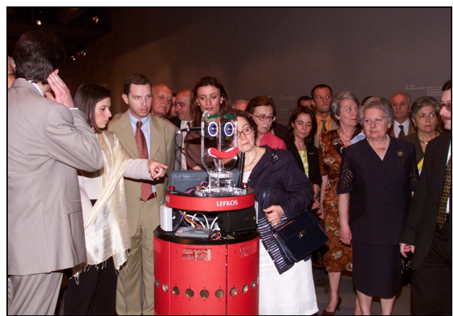
Figure 3: 'Lefkos' guides FHW visitors through the exhibition

Based on the above, the scientific goals concerning the navigation aspects of a robotic tour-guide include advanced techniques for monitoring the execution and for detecting and escaping from execution failures. Furthermore, they include sophisticated sensor interpretation techniques allowing the robot to monitor its environment and to adapt itself according to the abilities of the people it is guiding.