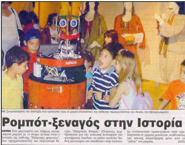
Figure 5: Front page of “Metrorama” newspaper showing young visitors touring the FHW exhibition with “Lefkos” during the 1-week trial period.

Worldwide, many museums and exhibition halls are currently exploiting such technologies, aiming at increasing their market shares. The potential offered by the introduction of media technologies is immense, provided that novel and attracting services will be offered as a result of such developments.