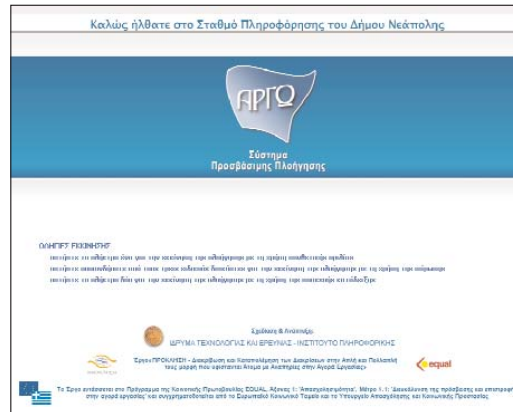
Initial Screen of the ARGO System

The ARGO System supports all typical functionalities of a browser application and additionally includes: