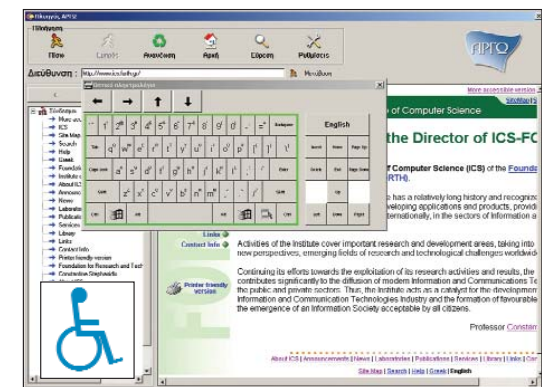
ARGO System for users with mobility impairments

The ARGO System is currently installed in two information kiosks in the municipalities of Cholargos (Attiki district) and Neapoli (Thessaloniki district).